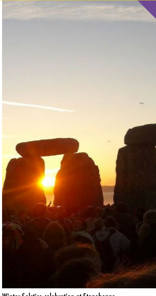
Winter Solstice celebration at Stonehenge