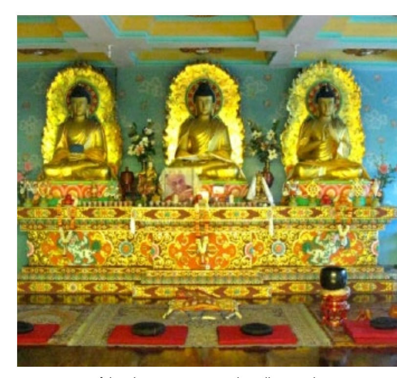
A representation of the trikaya in Vien Giac temple, Bodhgaya, India

(and yet interconnected) 'realities'. It is as if the Buddha (the 'Awakened One') can function at three different levels in three different 'forms'. When functioning on the terrestrial or historical level 'he' would assume the Nirmanakaya 'form' and appear, as it were, in flesh and bone (i.e. Buddha Shakyamuni). When functioning on a mental or archetypical level 'he' would assume the